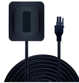
Figure: GRM-5853F5LRKW-BKGB327-JP80 A3.0