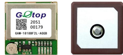
Figure: GAM-1818F2L-AGGB Top View