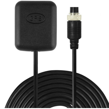
Figure : GRM-4538-GKGNHK4P300 Top View