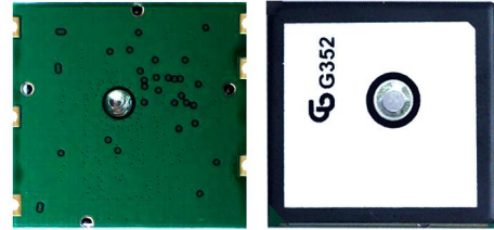
Figure1: GAM-2020S-GKBD Top View