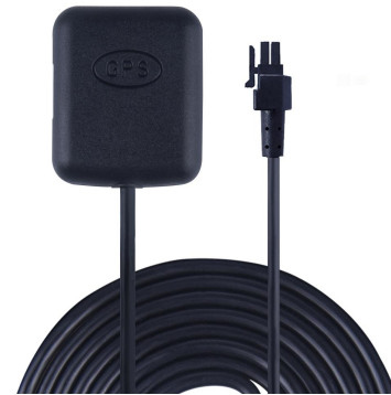
Figure : GGM-4538-MTBDMX150 Top View