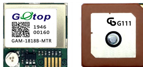
Figure1: GAM-1818B-MTR Top View